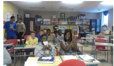
Fourth period students enjoy a little down time.